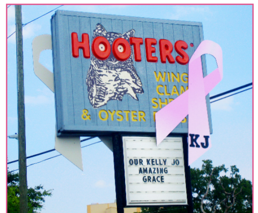
Top: Kelly Jo, 1995 Hooters Calendar cover girl.